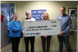
Bread Basket of Northeastern PA: Project Dash

This was the first year United Way implemented the “Lackawanna County Community Impact Grant.” These small grants are targeted for grass roots organizations with limited administrative capacity in an effort to try and serve more diverse populations residing in Lackawanna County that may experience difficulties when applying for other funding streams.