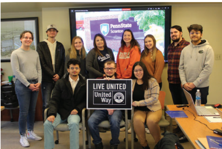
Penn State Scranton's VITA Internship Team.