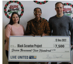
Black Scranton Project: Black History Month