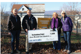
Greenhouse Project: Community Gardens