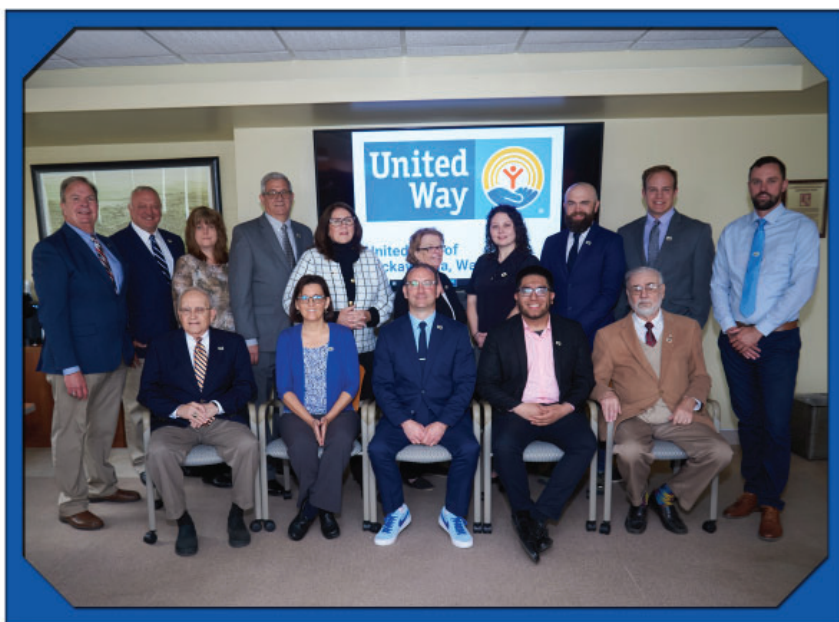
2022-2023 United Way Staff